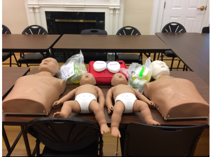
Pictured: A small sampling of the equipment the Heart Center has purchased on behalf of DUEMS's new CPR classes