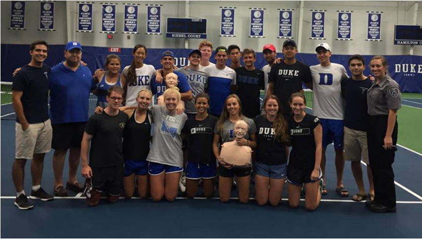
Pictured: We recently completed our first athletic team CPR training with Duke Tennis! Within the next few weeks we will also train Swimming & Diving and Men's Soccer.