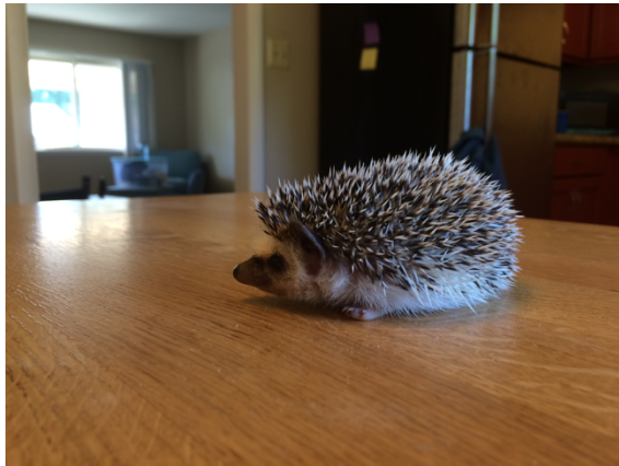
Our newest squad member: Herbert the Hedgehog