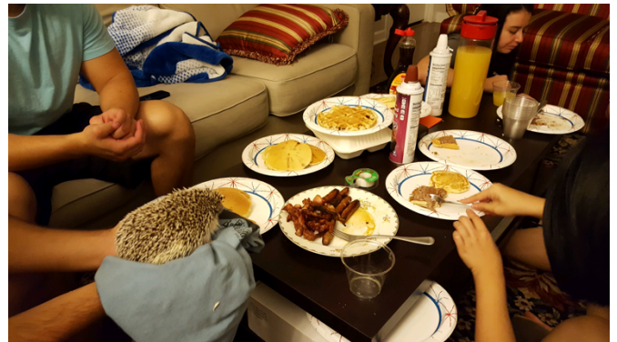
Here he is enjoying one of our squad social events, Pancakes v Waffles!