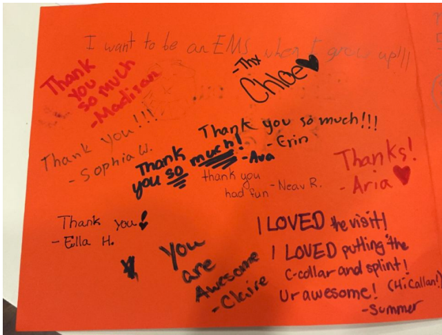
Thank you card from the FEMMES students for teaching them CPR, triage, basic medications, and the roles of first responders in the community.